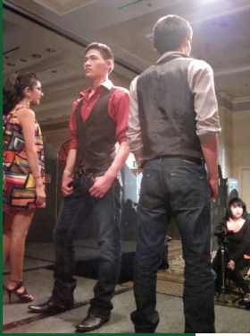
Students put on the Annual MVROP Fashion Show

High school students showcase graphic art, digital photography and video productions.