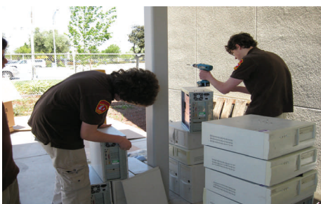
Forensic Science students help gather recycled CPUs for the MVROP E-Waste Collection Event

It is the responsibility of this generation to change the standards by which we live to ensure future generations will have a clean and healthy planet. Mission Valley ROP has set Green Technologies as a priority for its courses. Through budding relationships and valuable partnerships, MVROP is setting out to become a leader in creating new curriculum where students can learn the technologies that will be the industry standards for the next twenty years. According to the American Solar Energy Society, “The US Renewable and Energy Efficiency Industries are expected to create between 19 million and 37 million jobs and generate up to $4 trillion dollars in annual revenue by 2030.” Recently, MVROP held an E-Waste Collection Event that successfully recycled over 18,000 tons of recycled electronic waste. Proceeds of nearly $2,000 will go towards the MVROP Green Initiative and the Forensic Science Program.