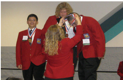
Students receive their first place medals

The MVROP SKILLSUSA Forensic Science Student Chapter participated in the SKILLSUSA California Leadership Conference in Fresno. Over 800 students competed in the Crime Scene Investigation Event.